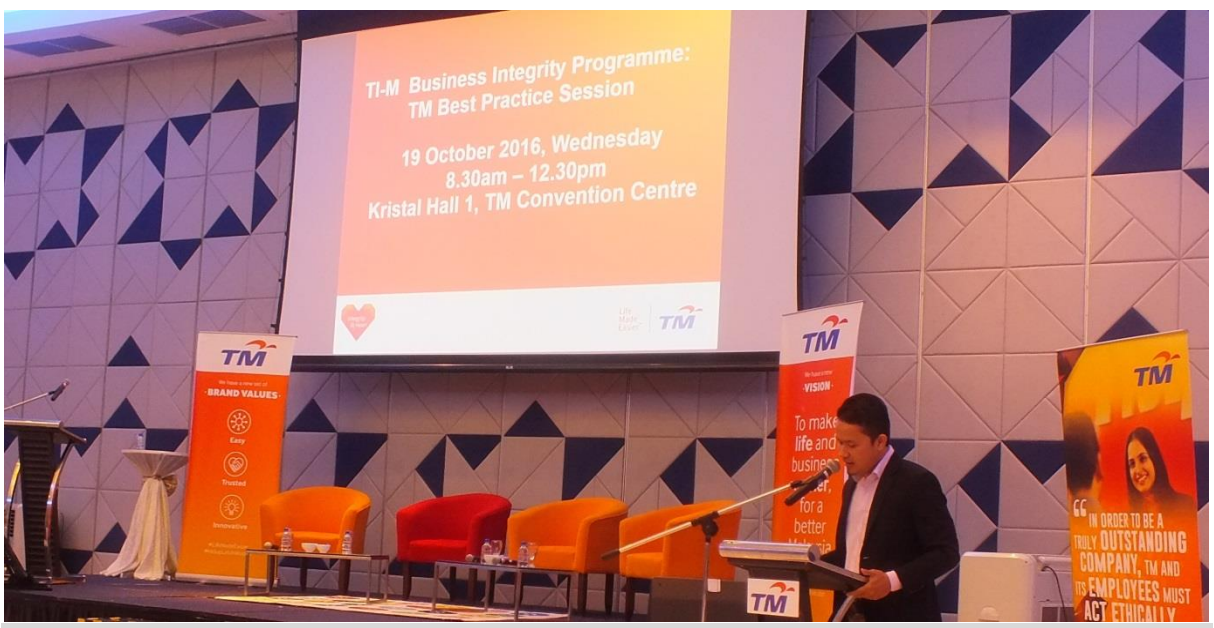
The 9th Business Integrity Best Practice Sharing Session