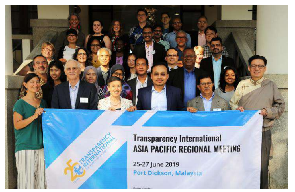
Group photo of participants during the Transparency International Asia Pacific Regional Meeting

TI-Malaysia was honoured to be the co-host for the 2019 Transparency International Asia Pacific Regional Meeting from 25 – 27 June 2019 at Port Dickson. The theme for this year is "Innovating Faster than the Corrupt".