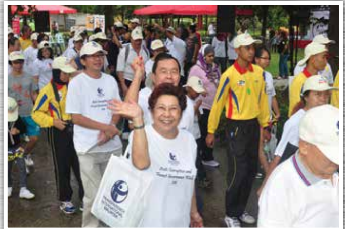
Public attended the walk to show their support and make a pledge against corruption.

distribute merchandise and materials on their anti-corruption initiatives. TI-M also set up a signature board to allow the participants to sign along with the VIPs in their pledge to fight corruption. The event was organised as part of the United Nations' designated International Anti-Corruption Day to help raise public awareness of corruption, and to bring political leaders, governments, legal bodies and lobby groups to work together against corruption.