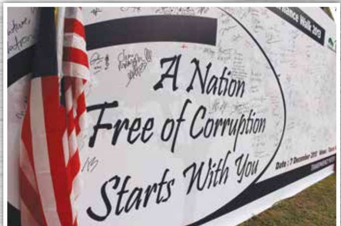
The official slogan for the Anti-Corruption and Forest Governance Walk 2013