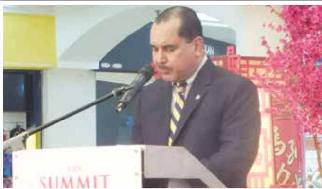
Dato' Akhbar Satar (TI-M President) launching FixMyStreet / Aduanku.my

On 21st January 2014, Transparency International Malaysia (TI-M) in collaboration with Sinar Project and SJ Echo launched a new free website service to empower Subang Jaya citizens to transparently report and monitor local council issues. Citizens can report issues such as potholes, uncollected garbage, illegal dumping, faulty street lights, broken drains, double parking, and 'kaput' traffic lights and upload photo evidence and location markers.