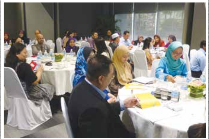
As part of TI-M's Corporate Integrity System Best Practice Seminar series, participating corporations are provided with a platform to exchange ideas on further improving integrity in the business community.

On the 29th of October, Transparency International – Malaysia (TI-M) and Siemens Malaysia Sdn Bhd jointly organised a seminar to share best practices in establishing and managing compliance and integrity systems. A total of 36 participants from 14 organisations attended the seminar. The seminar was part of the TI-M's Corporate Integrity System Best Practice Seminar series and provided a platform for corporations in this area to exchange ideas and views to further improve the level of integrity in the business community.