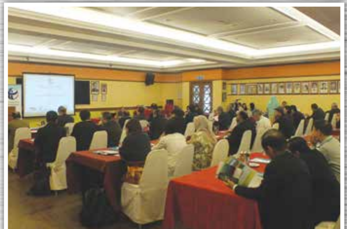
The conference participants