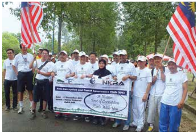
YB Senator Datuk Paul Low Seng Kuan (Minister in the Prime Minister's Department) and Dato' Hjh Sutinah Sutan (Deputy Chief Commissioner of Malaysia Anti-Corruption Commission) "flag off" the walk together with Dato' Akhbar Satar (TI-M President)

distribute merchandise and materials on their anti-corruption initiatives. TI-M also set up a signature board to allow the participants to sign along with the VIPs in their pledge to fight corruption. The event was organised as part of the United Nations' designated International Anti-Corruption Day to help raise public awareness of corruption, and to bring political leaders, governments, legal bodies and lobby groups to work together against corruption.