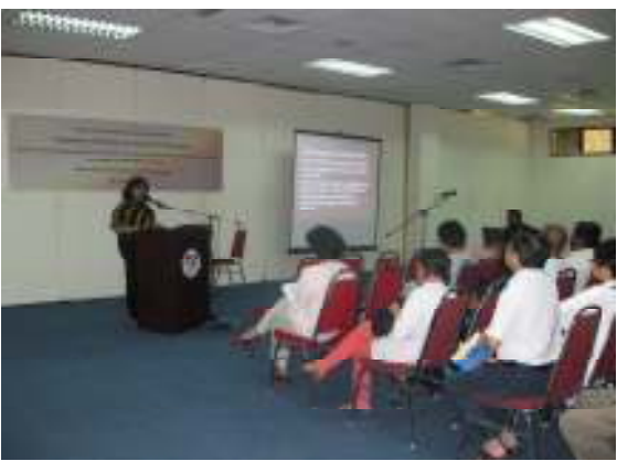
Workshop in Penang.

Phase 2 of the FOI project involves a series of half-day talks and sessions to create awareness amongst targeted groups. These groups will represent, among others, the business, legal, academic and civil society groups, the civil service and political parties. The purpose is to introduce the main ideas of FOI and to persuade or gain support for FOI legislation. It is proposed that 10 sessions be organized over the year. Six workshops have been successfully organized to-date: in Klang, KL, Ipoh, Penang, Sabah and Kelantan.