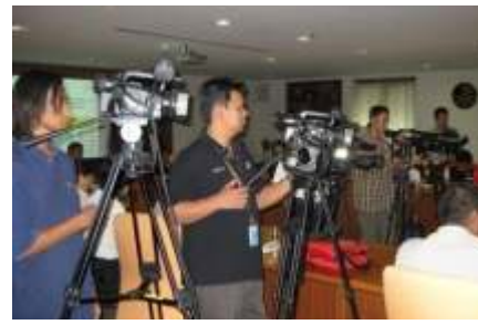
MAIN FINDINGS IN THE GCB 2009