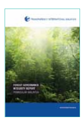
Forest Governance Integrity Report – Peninsular Malaysia

1. Prepared a country report and Risk Analysis using the FGI- Anti Corruption Manual on the current forestry situation in Peninsular Malaysia