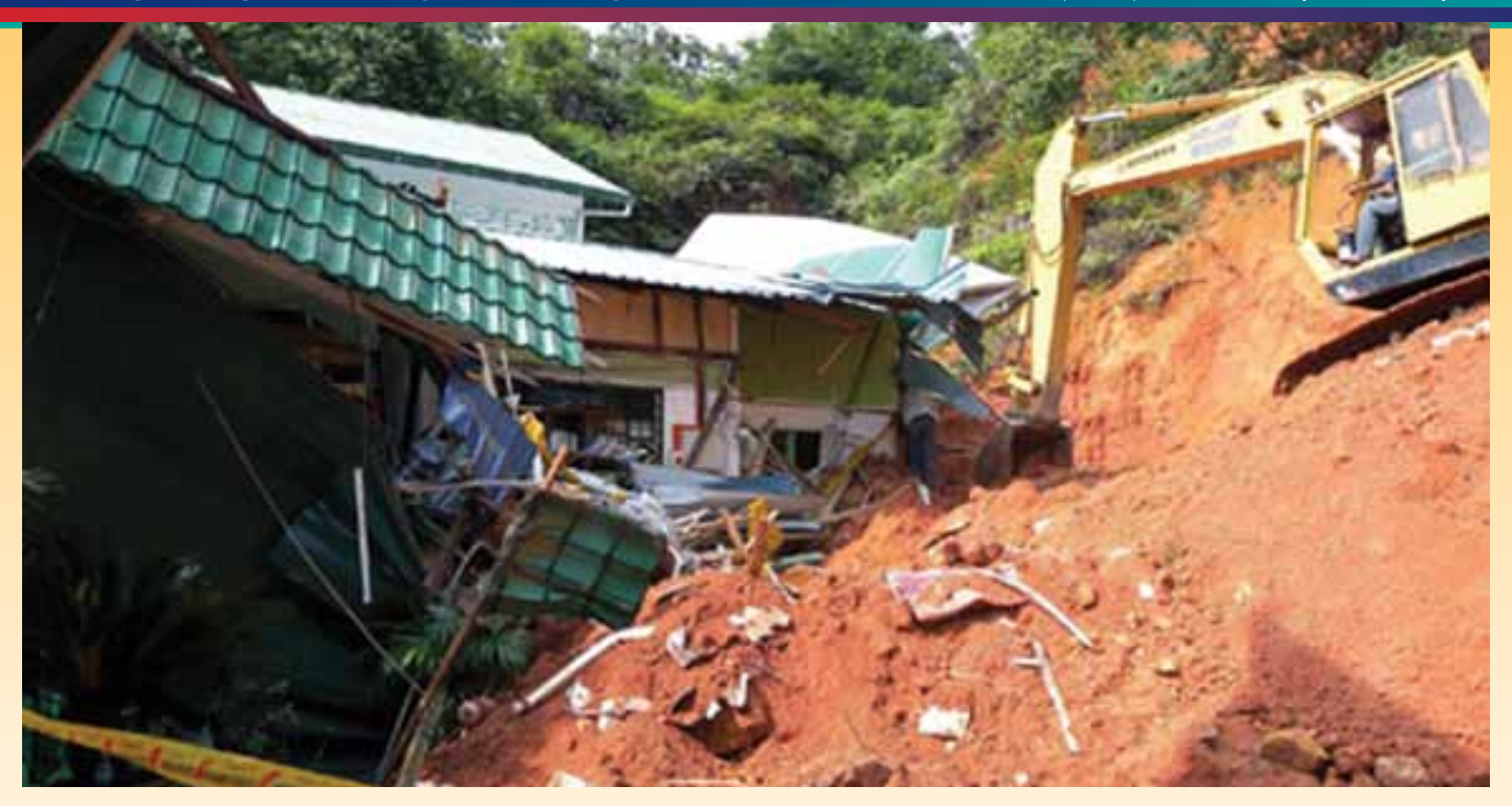
Al-Taqwa orphanage crumbles in landslide

KDN Permit No: PP 11959/04/2010 (025399) Vol 21 No 1/2 (Jan – Jun 2011)