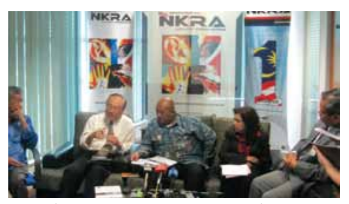
Press Conference with Dato' Hisham Nordin, Director of NKRA at MACC

As a follow-up to the memorandum, on 19 May 2011 members of TI-M's Executive Committee (Exco) met with MACC's NKRA team on Fighting Corruption for a briefing on the steps being taken by the government to address money politics and reform political financing in Malaysia.