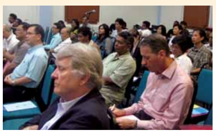
A section of the audience at the Chinese Assembly Hall, Kuala Lumpur

The public seminar was held at the Chinese Assembly Hall, Kuala Lumpur. This was jointly organised with TI-M's