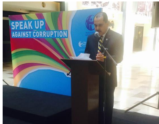
TI-M president gave his speech at the Launch at Publika Mall and public engagement