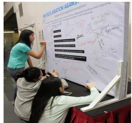
The youth wrote message on the pledge board on their commitment to combat corruption