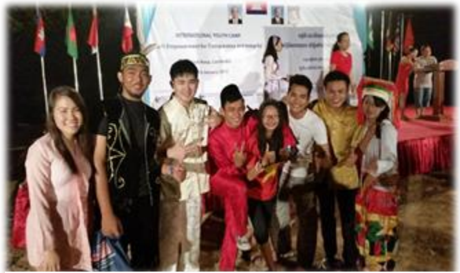
'Youth Empowerment for Transparency and Integrity (YETI)' camp in Cambodia Jan 2015

TI-M's people engagement strategy applied a stronger focus on the youth started since 2014. On 4-10 January 2015, TI-M sponsored three youth representatives 1 to participate in Transparency International's (TI) International Youth Camp (IYC) on 'Youth Empowerment for Transparency and Integrity' in Cambodia. Attended by 40 youth from seven Asian Countries, the camp sought to enhance the young participants' sense of belonging to a community, inspire them to stand up to corruption and equip them with the tools to do so. The delegates participated in sessions on human rights, good governance, the separation of powers and international anti-corruption frameworks, presented by leading experts in the field.