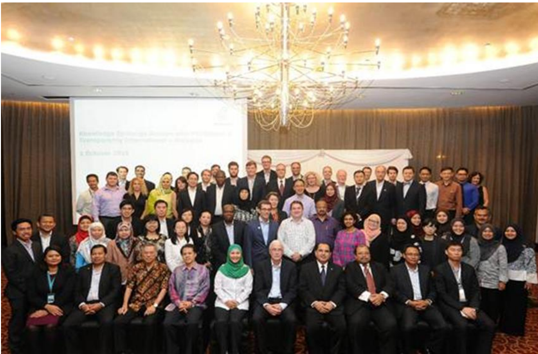
Knowledge Sharing Session with ISO/PC 278 , Petronas Group and TI-Malaysia