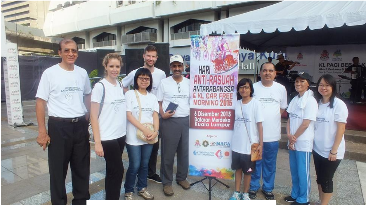
At KL Car Free Morning and Anti Corruption Day

and success for Malaysia. The event concluded successfully with many interested fellow Malaysians, the youth in particular, showing commitment towards integrity.