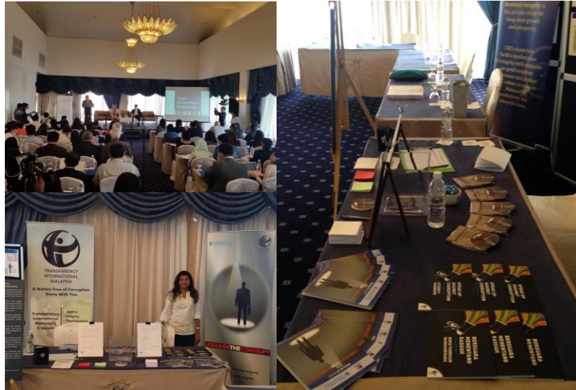
TI-Malaysia at the OGP Seminar & Exhibition

In 2015, TI-M participated in the Open Government Partnership Seminar and Exhibition organized by IDEAS on 18 th August 2015. The seminar and exhibition aimed to promote the discourse on the strengths and weaknesses of the current open data initiatives by the Malaysian government and the potential benefits of open data for improving good governance, civic engagement and economic growth.