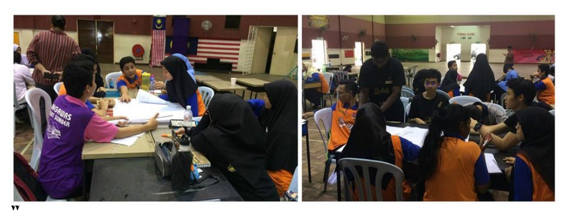
ere divided into a few groups for project discussion

The first day of the programme kicked off with an interesting ice-breaking game that tested the integrity of the students. With this, the topic of Integrity was smoothly introduced to them. The day went on with presentations on topics such as 'TI-M as an NGO', 'Ethics & Integrity' and 'Corruption'. Short games were played and activities were given in between presentations, keeping the students well engaged. The final part of the first day programme involved having the students break in to groups and inventing their own projects that could promote integrity or combat corruption. Students were then asked to present their ideas.