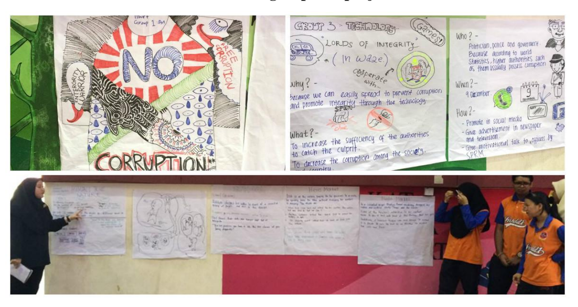
The outcome of the student's discussion