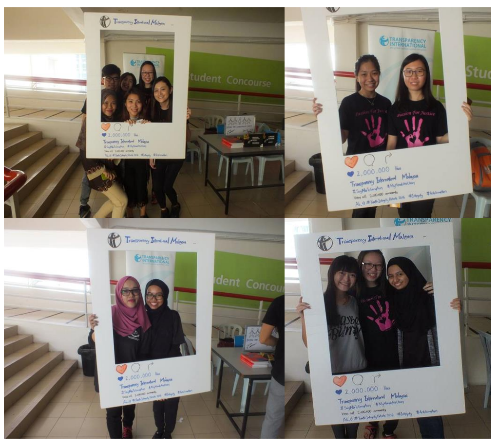
The use of Instagram photo frame is one of the most effective way to engage with youth rather than lectures

picture frame, indicating their support for the course of TI-M. A few volunteers were recruited during the roadshow.