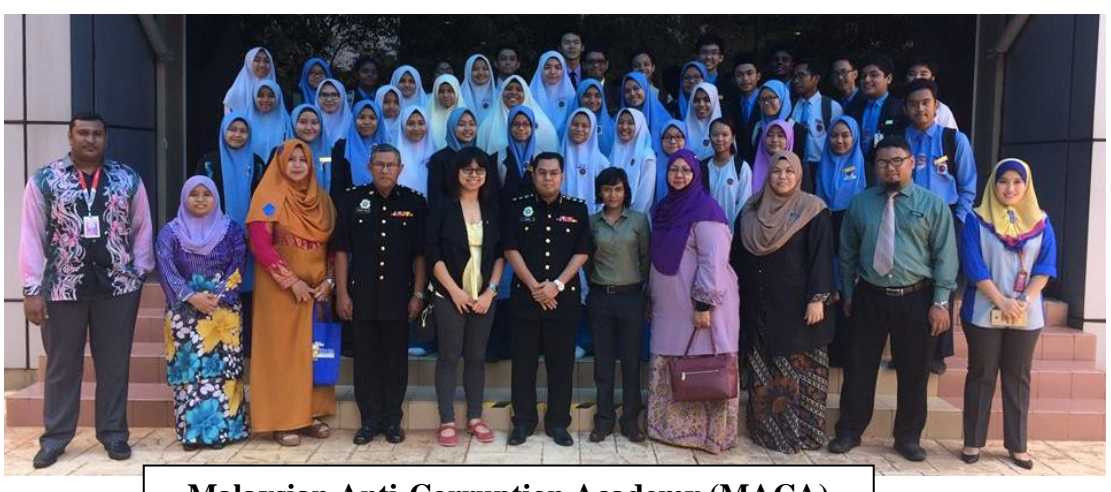
Malaysian Anti-Corruption Academy (MACA)

investigating corruption cases, the process of prosecution and charging and the punishments for the offence of corruption.