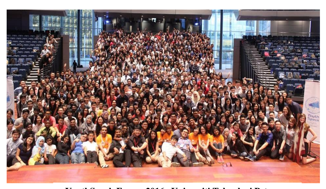
YouthSpeak Forum 2016, Universiti Teknologi Petronas

TI-M was invited by AIESEC Malaysia for the 'Youth Speak' Forum 2016 at Universiti Teknologi Petronas in January 2016 which attracted over 500 participants. The 'Youth Speak' forum organised by AIESEC, to bring together young and senior leaders, sharing inspiring stories and discussing pressing global issues, aim to generate new and, most importantly, actionable ideas that will impact Malaysia and its future. Unilever (Malaysia) Holdings Sdn. Bhd, Shell Malaysia, Teach for Malaysia were among other organisations that were present at the forum.