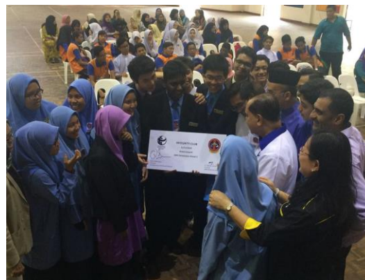
At the Parliament