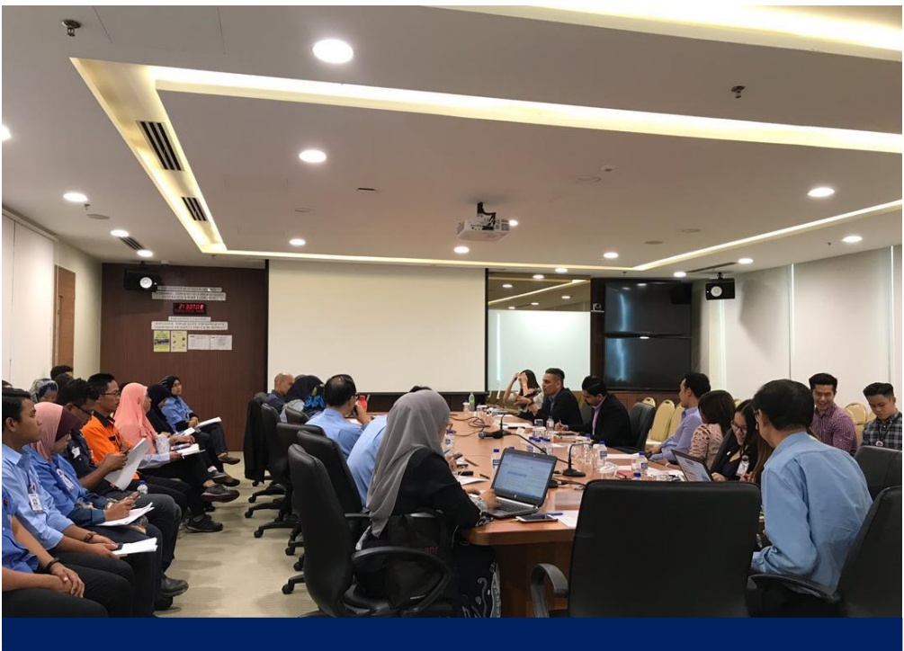
Business Integrity Best Practice training session