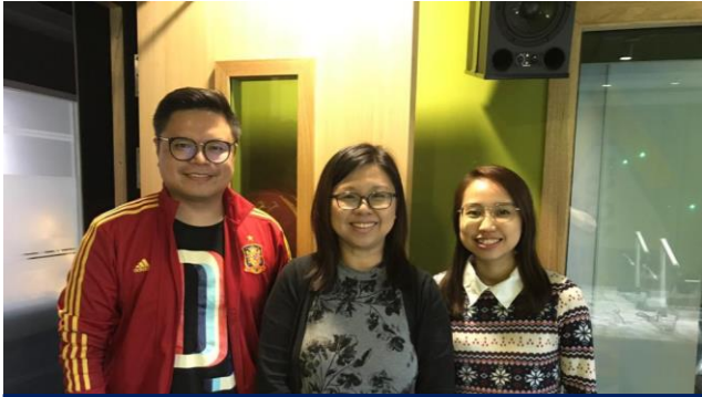
Interview at Chinese radio station -Cityplus fm