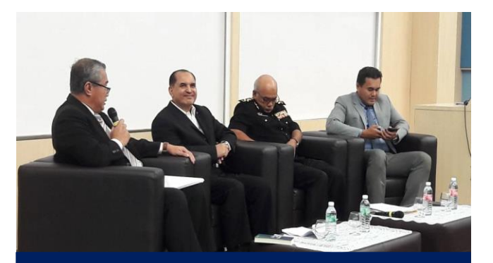
Panel Discussion at Universiti Utara Malaysia