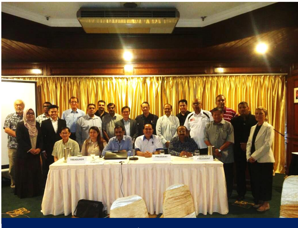
Members at the 20<sup>th</sup> Annual General Meeting

On 24th March 2018, Transparency International Malaysia (TI-M) held its 20th Annual General Meeting (AGM) at the Royal Selangor Club, Dataran Kuala Lumpur.