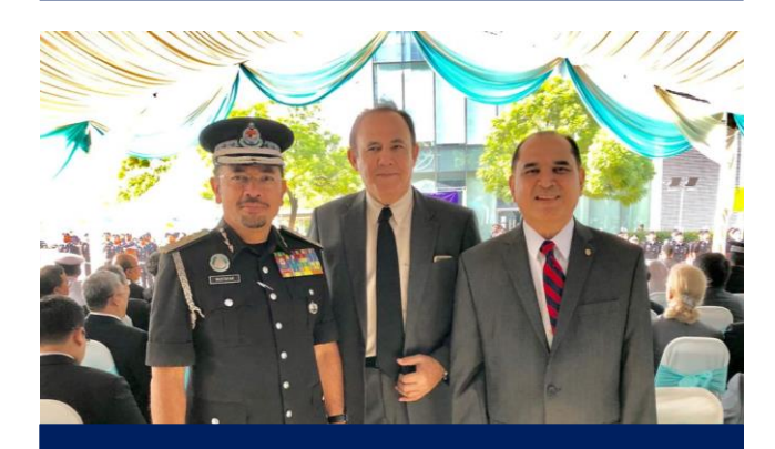
Session with Immigration Department Malaysia