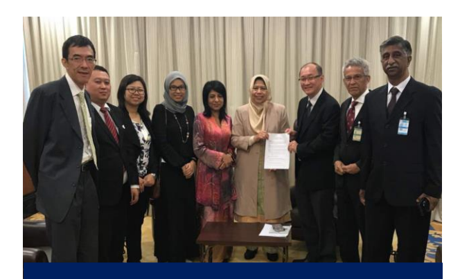
GIAT Members had a close door session with the Minister of Housing and Local Council, YB Puan Zuraida Kamaruddin