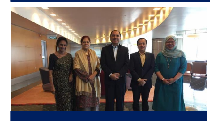
Merdeka Award Committee