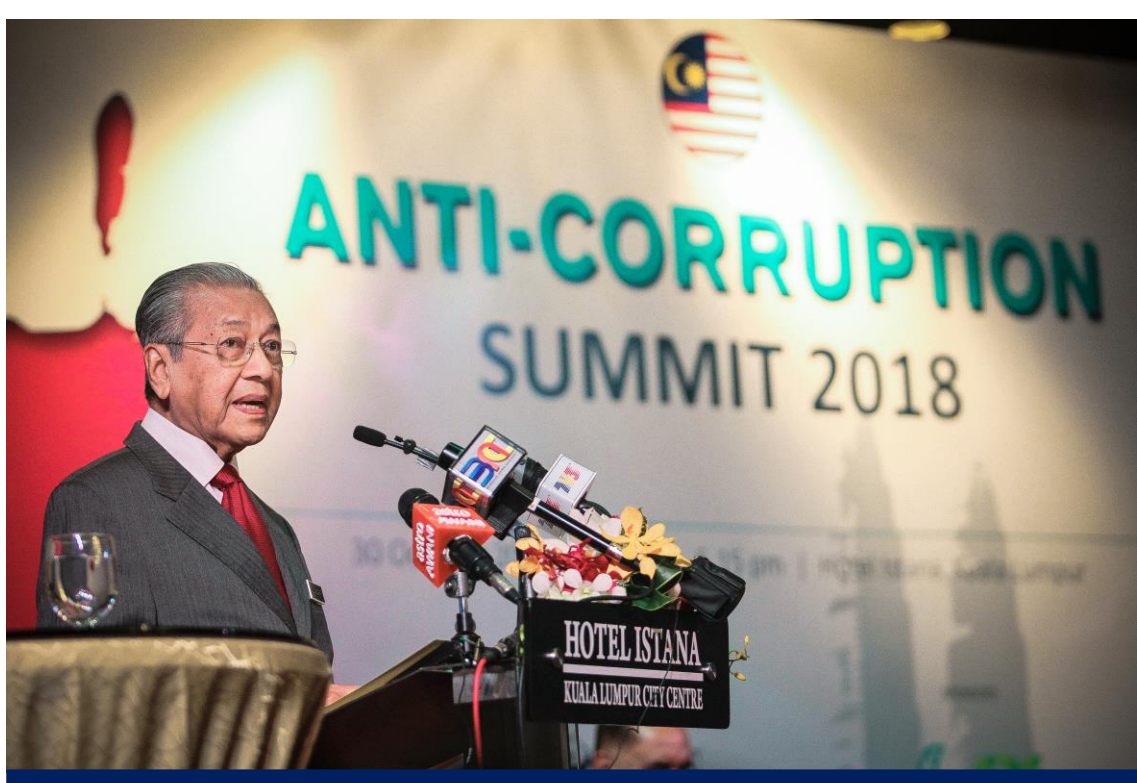
Prime Minister, Tun Dr Mahathir delivered the keynote address

Under the theme Good of Governance and Integrity for Sustainable Business Growth. several interesting topics were discussed by the respected figures. It was a great honour to have Prime Minister. Tun Dr Mahathir to deliver the keynote address.