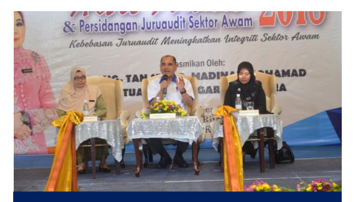
Conference of Public Sector Auditors