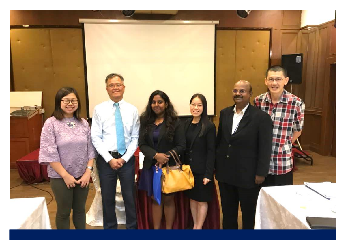
TI-M Members with representative from respective organisation