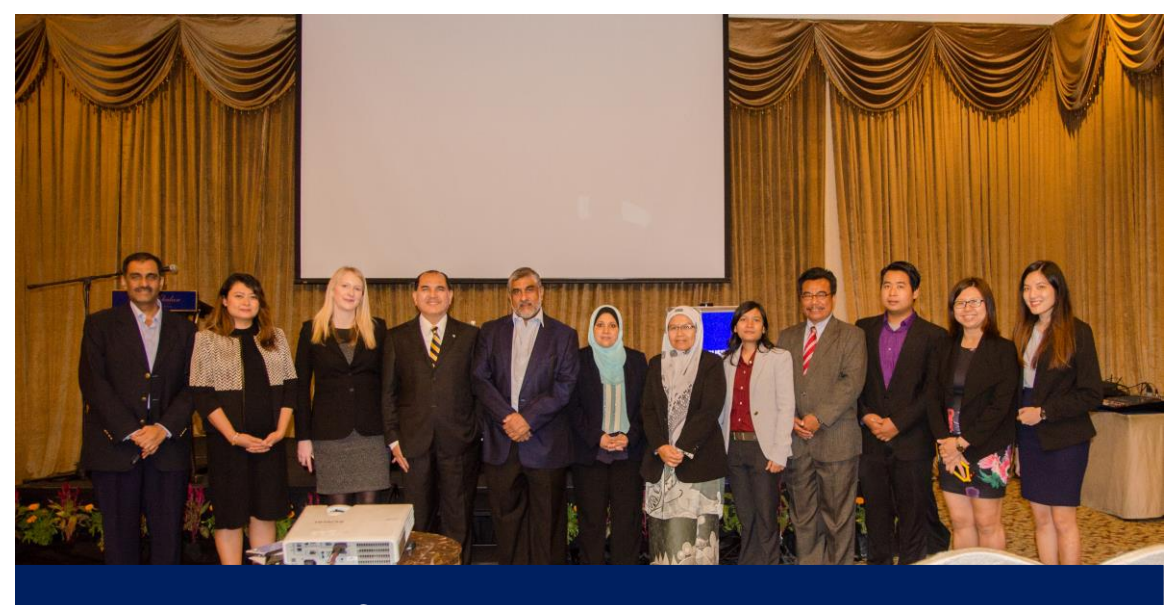
TI-M BICA project members with the researchers