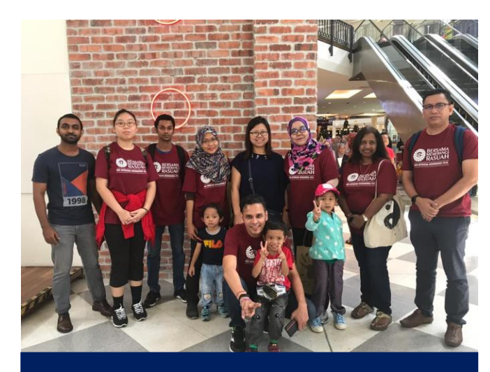
TI-M members with the volunteers at Alamanda Putrajaya after conducting street poll