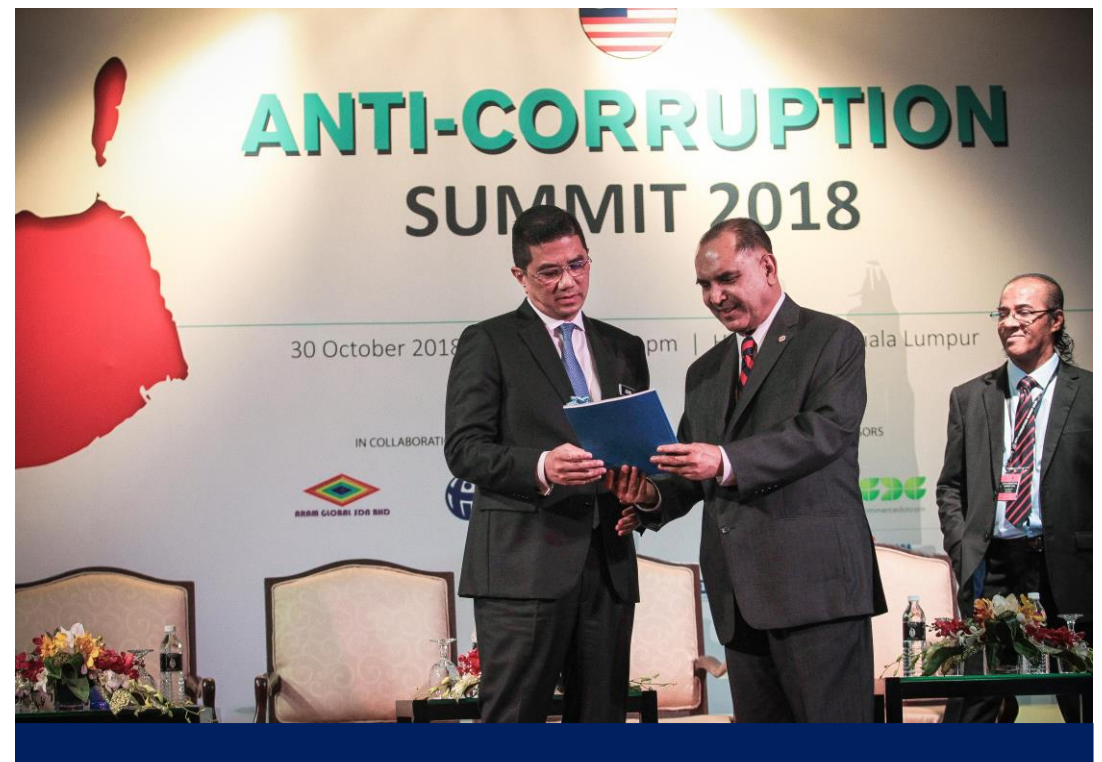
Closing remarks by YB Dato Seri Azmin Ali

Anti-corruption Summit 2018 end well with closing remarks from YB Dato Seri Muhamed Azmin bin Ali, the Minister of Economic Affairs.