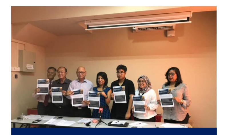
GIAT member presented Good Governance agenda prior to the 14 General Election