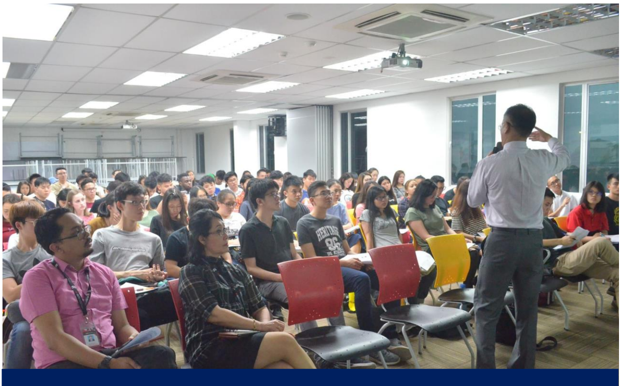
Business students from INTI International College