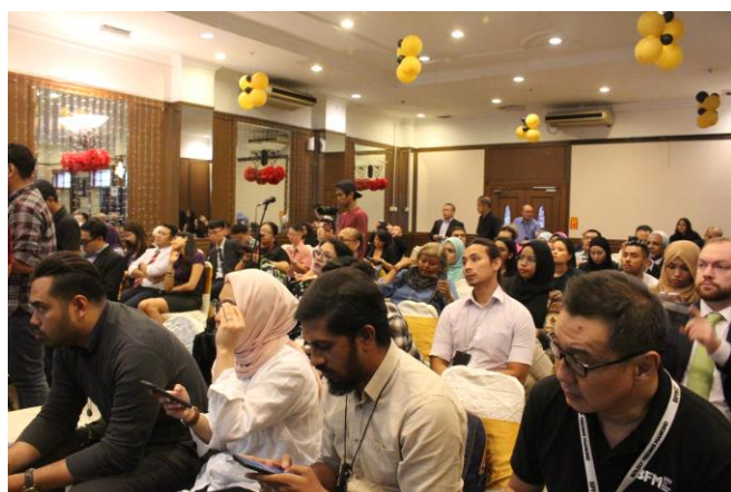
Representative from Media, Consulates, MACC, Prime Minister's Department, Civil Societies Organisations.