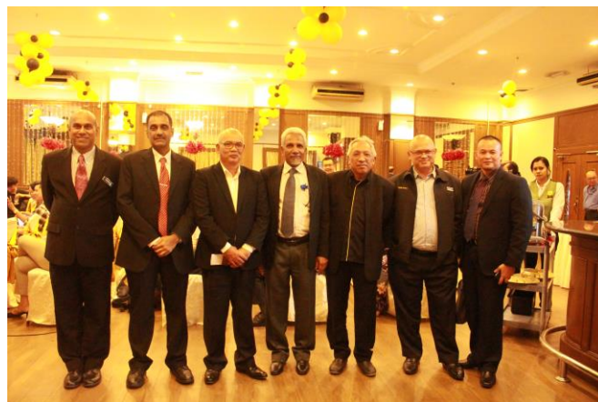
President of TI-M with the distinguished guests