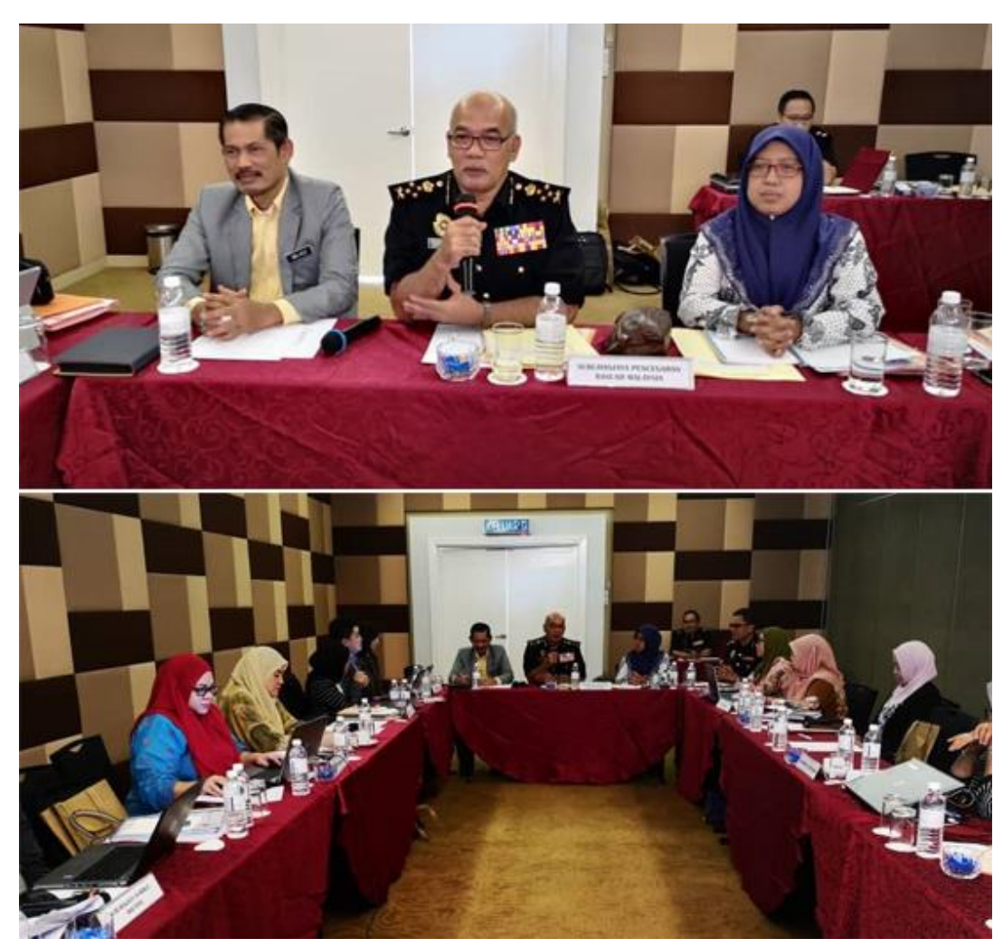
During the Strategic Plan for Corporate Integrity System Malaysia workshop

The Strategic Plan for Corporate Integrity System Malaysia (CISM) 2020-2022 was organized by Malaysian Anti-Corruption Commission (MACC) on 5 and 6 September 2019, in Shah Alam.