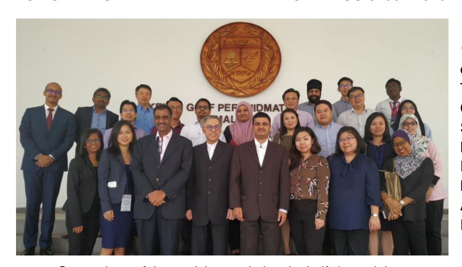
Group photo of the participants during the half-day training

TO ESTABLISH AND IMPLEMENT EFFECTIVE ISO 37001:2016