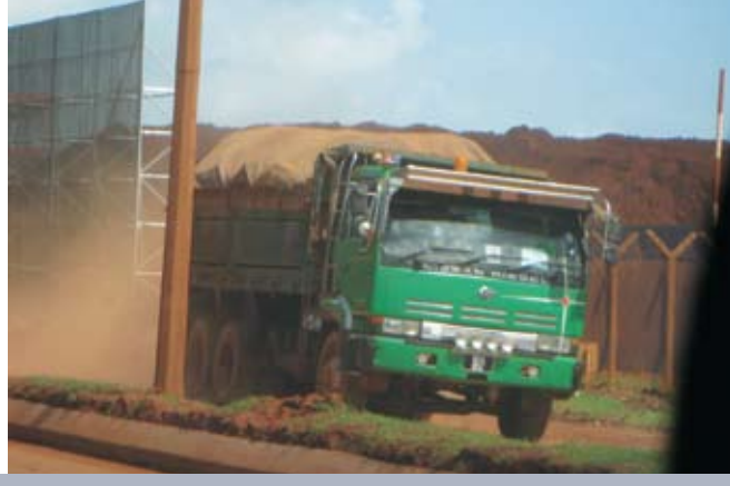
Port of Stockpiled Bauxite, The Giat Coalition Visits the Kuantan Harbour