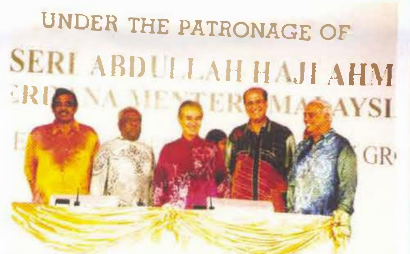
MAICCI- TIM (Signing Ceremony)