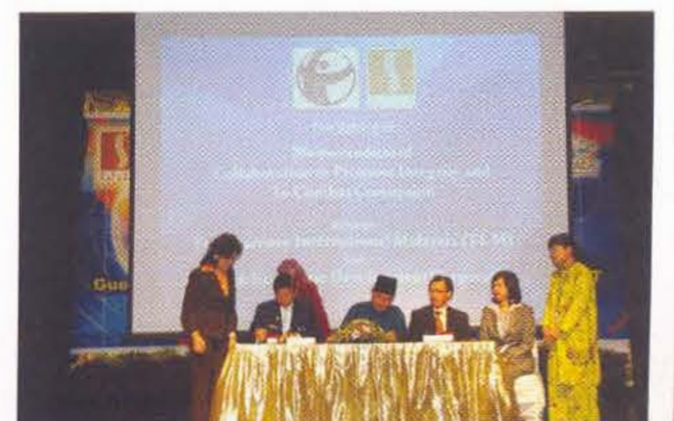
SEDC- TIM (Signing Ceremony)