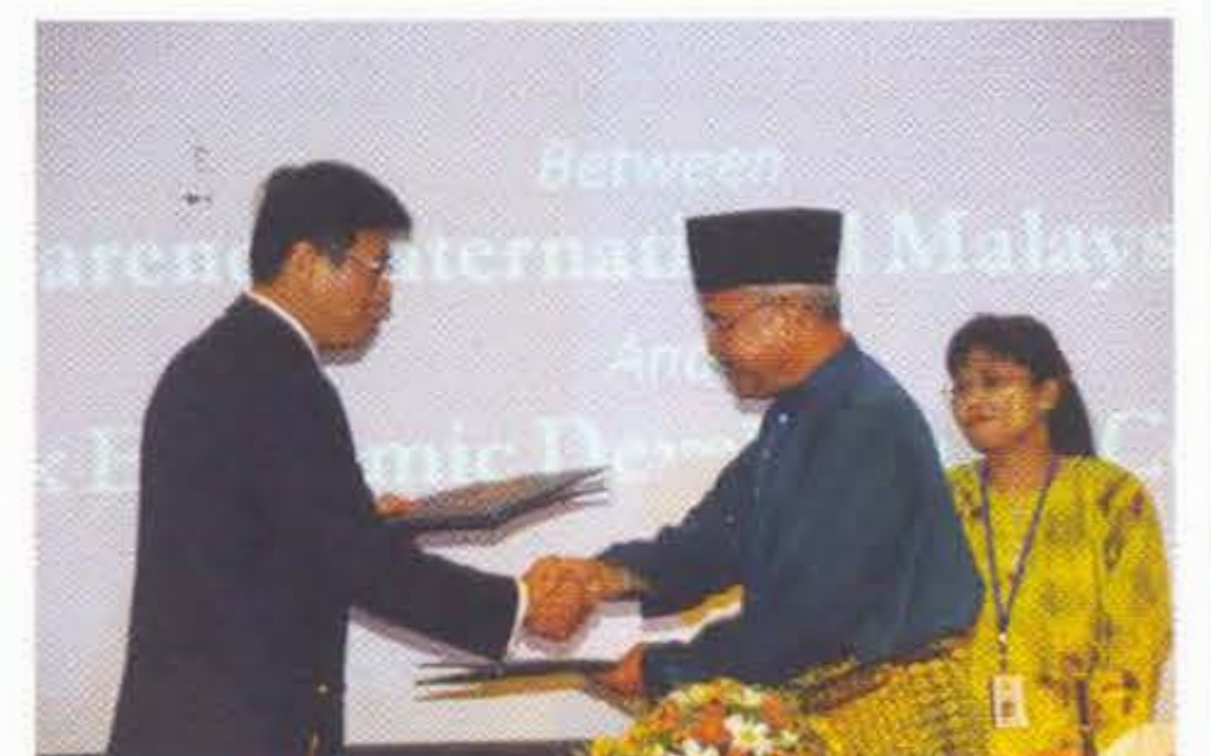
SEDC- TIM (Signing Ceremony)