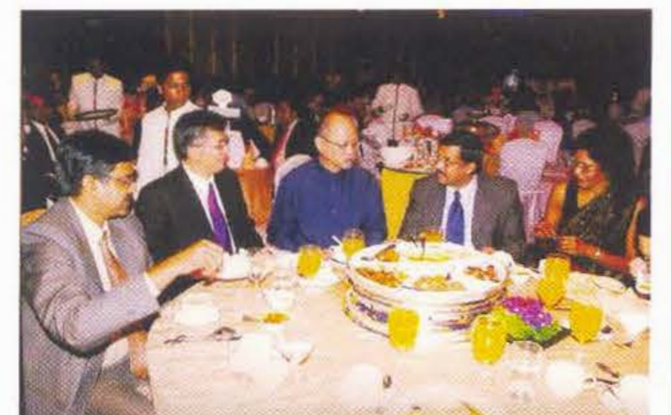
MAICCI- TIM (Signing Ceremony)