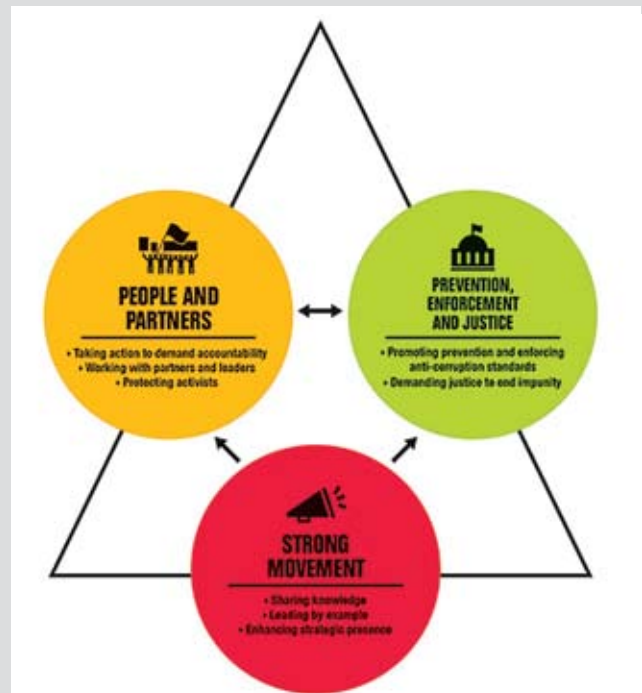
Exhibit 1: Three Main Thrusts-By TI-S

In light of the brainstorming session, TI-M acknowledges that there would be a need for change in terms of its approach to certain project and activities. Thus, following the guidance given