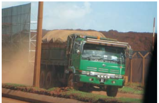
Port of Stockpiled Bauxite, The Giat Coalition Visits the Kuantan Harbour