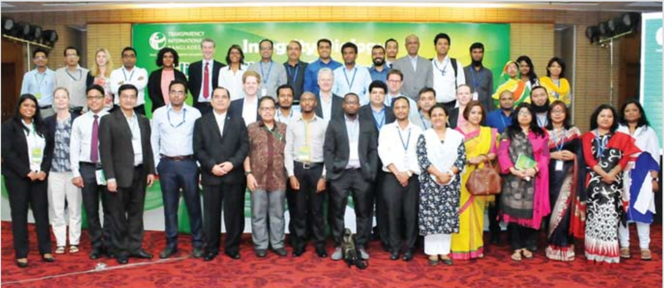
Climate change activists and experts at the dialogue.

One of the biggest challenges on this emission policy was balancing the economic development and protecting environment.