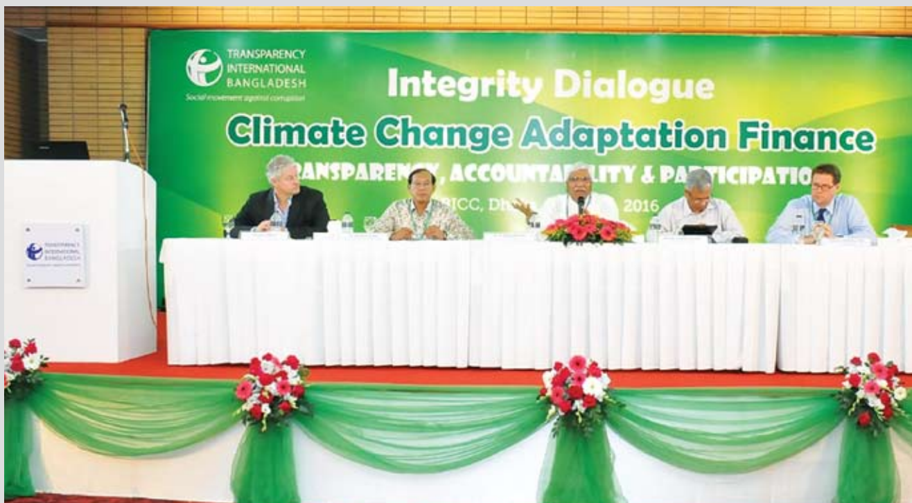
Representatives at the Dialogue

The “ Dhaka Integrity Dialogue on Climate Change Adaptation Finance: Transparency, Accountability and Participation ” was held on 29 th March 2016 at the Bangabandhu International Conference Center (BICC). It was attended by a group of climate change activists and experts from Australia, Germany, India, Indonesia, Kenya, Malaysia, the Maldives, Nepal, the Netherlands, Sri Lanka and the USA.