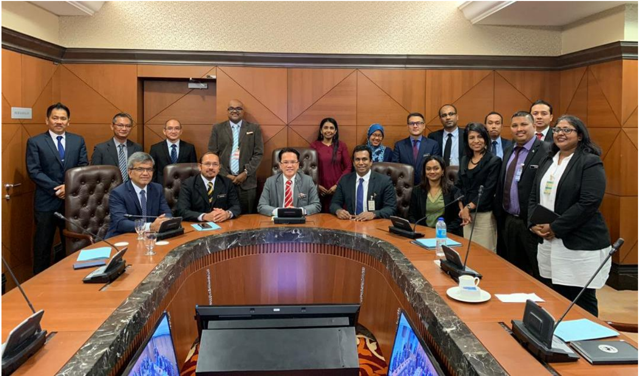
YB Datuk Liew Vui Keong (seating in middle) with the NGOs attended during the session

Transparency International Malaysia was among the few non-governmental organizations invited to attend the briefing and discussion session of the National Anti-Financial Crime Centre (NAFCC) with YB Datuk Liew Vui Keong, Minister in the Prime Minister's Department.