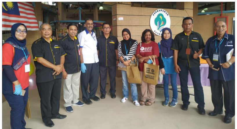
Group photo of TI-M with MACC and Top Glove at HARA