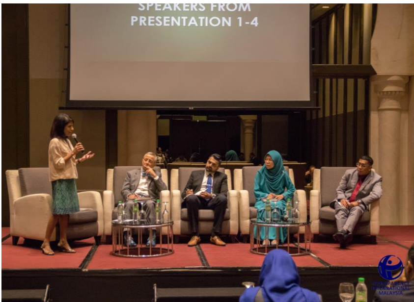
During the Q&A Session

(Full report available at www.transparency.org.my )