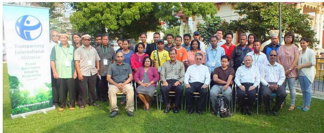
Group photo : Workshop on Enhancing Participation in Forest Watch Activities – 23 rd January 2014.

Through FGI’s prior engagement with indigenous communities, it was found that indigenous peoples needed a platform to be able to report forest offences to the authorities. The workshop therefore engaged indigenous communities in capacity building activities so that they can participate in forest governance through TI-M FGI- Forest Watch.