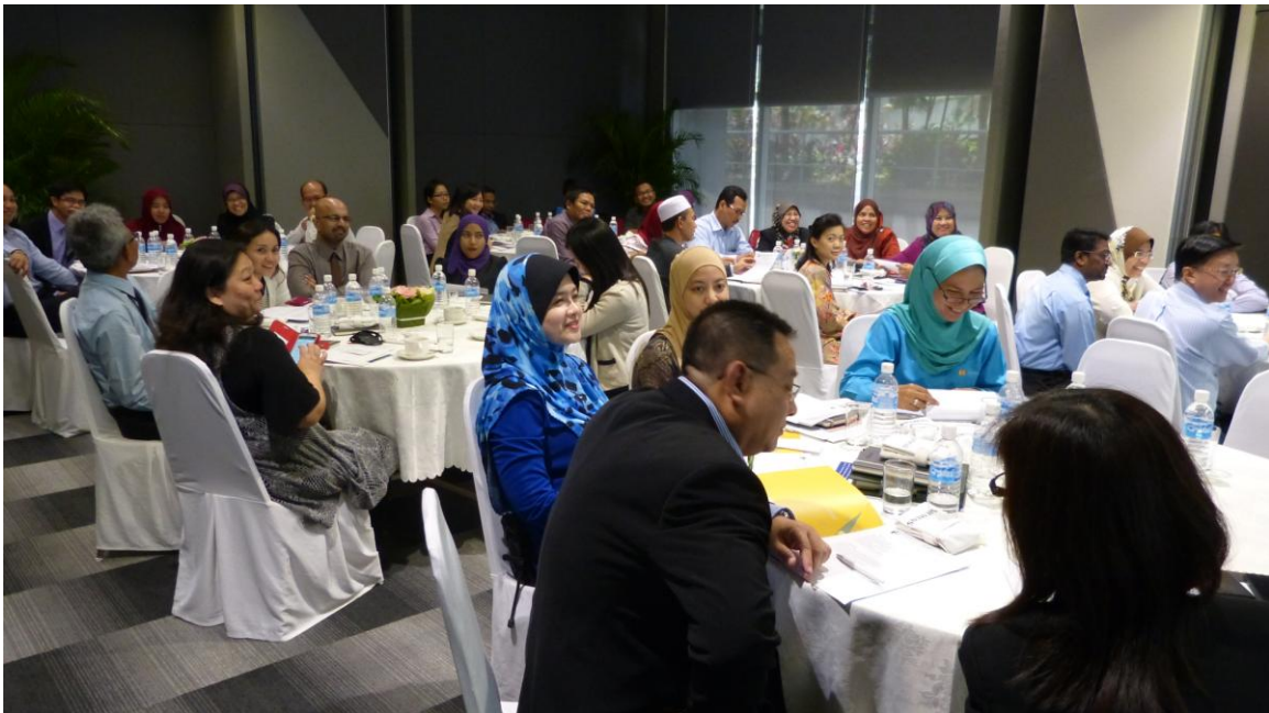
BIP Best Practice Forum at Siemens – 28 th October 2013