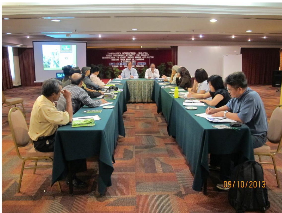
Meeting in Action : Introduction to Forest Watch Mobile Application Meeting with NGOs in Sarawak – 9 th October 2013.