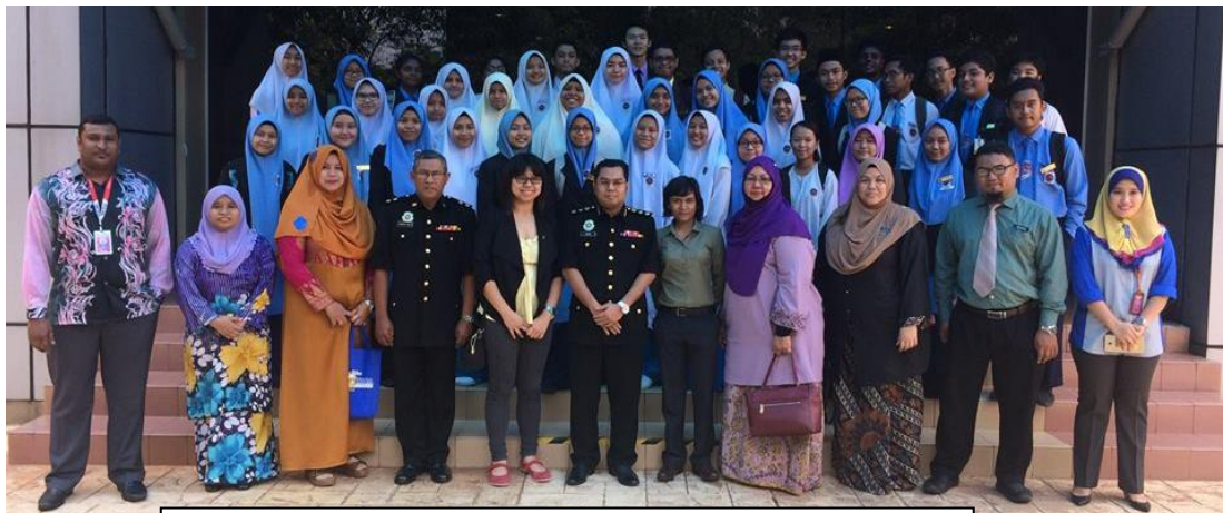
Malaysian Anti-Corruption Academy (MACA)