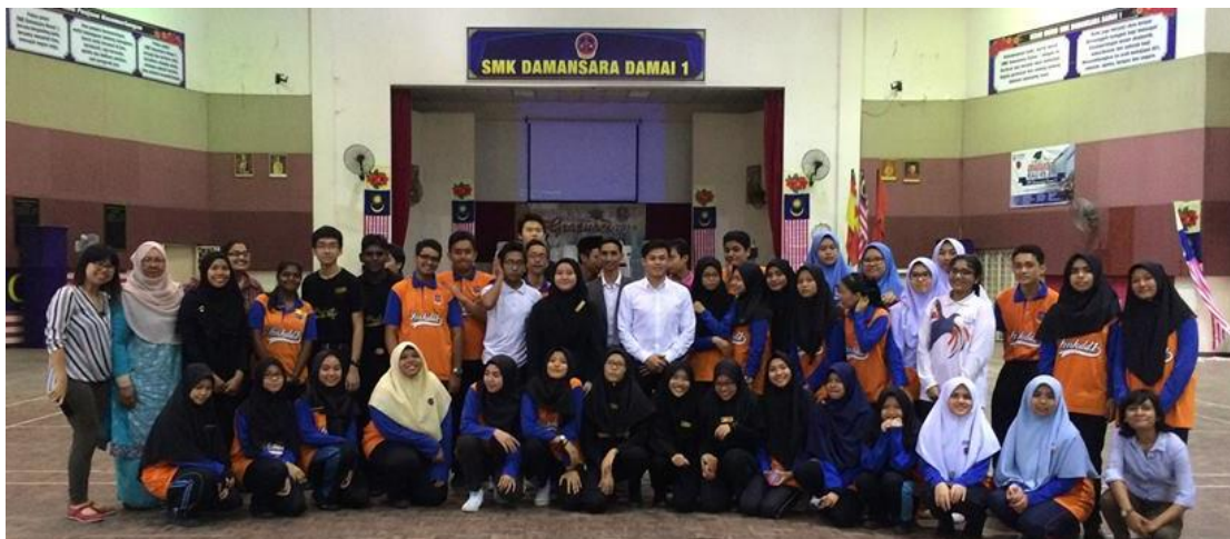
Group photo during day 1 of integrity programme at SMK Damansara Damai 1

TI-M ran a series of activities in relation to Integrity and Anti-Corruption in a three-day programme with SMK Damansara Damai 1 (SMKDD1). The school had 40 of their students, comprising prefects and librarians, participate in the programme which was held 9 th – 11 th November 2016.