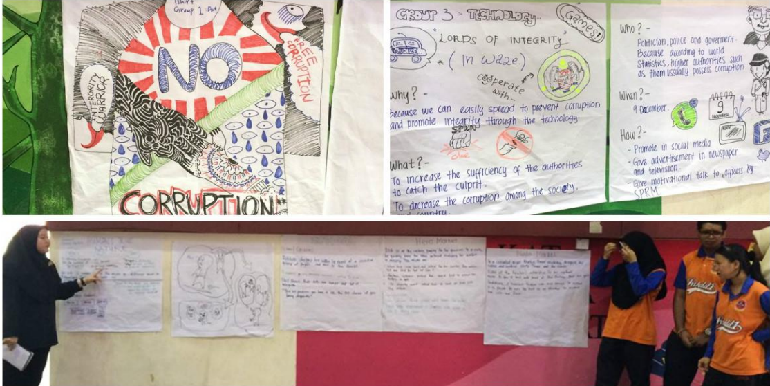
The outcome of the student's discussion