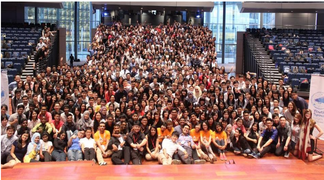
YouthSpeak Forum 2016 , Universiti Teknologi Petronas

TI-M was invited by AIESEC Malaysia for the 'Youth Speak' Forum 2016 at Universiti Teknologi Petronas in January 2016 which attracted over 500 participants. The 'Youth Speak' forum organised by AIESEC, to bring together young and senior leaders, sharing inspiring stories and discussing pressing global issues, aim to generate new and, most importantly, actionable ideas that will impact Malaysia and its future. Unilever (Malaysia) Holdings Sdn. Bhd , Shell Malaysia, Teach for Malaysia were among other organisations that were present at the forum.