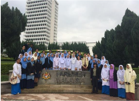
At the Parliament

The field trip ended with its final visit to the Malaysian Parliament. Students gained some knowledge on how issues are debated at the Parliament and how bills get passed by the lawmakers.