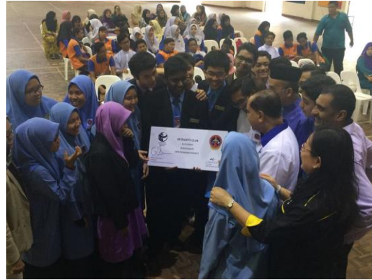
During the official launch